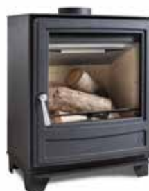
Ecoburn 5 Widescreen