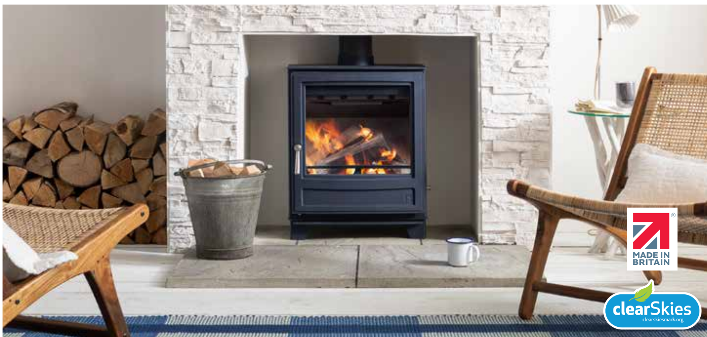
Ecoburn 5 Widescreen Series 3 in Atlantic blue

The Ecoburn 5 Widescreen multi-fuel stove features the latest in Arada heating technology that combines a traditional stove appearance whilst meeting Ecodesign standards for clean burning on either wood or solid fuel.