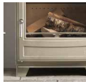
Available in multiple colours, all easy to keep clean

Optional Extras: Safety Handle / Rear heat shield / Direct air kit / Floor fixing kit