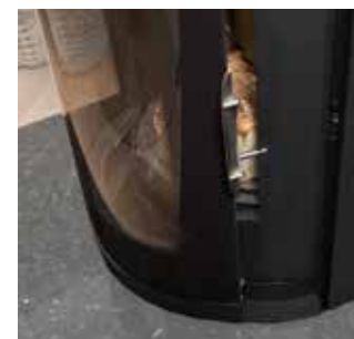
Curved glass door with click-close door latch