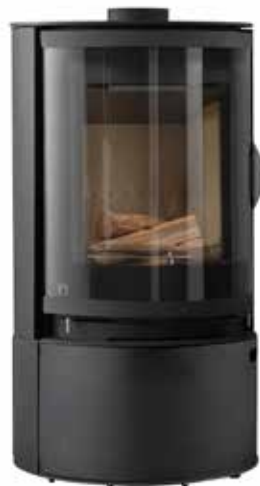
Hoxton with optional tall log store accessory