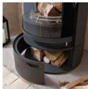
Convenient, tidy storage (short log store shown)