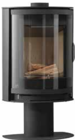
Hoxton with optional tall pedestal accessory