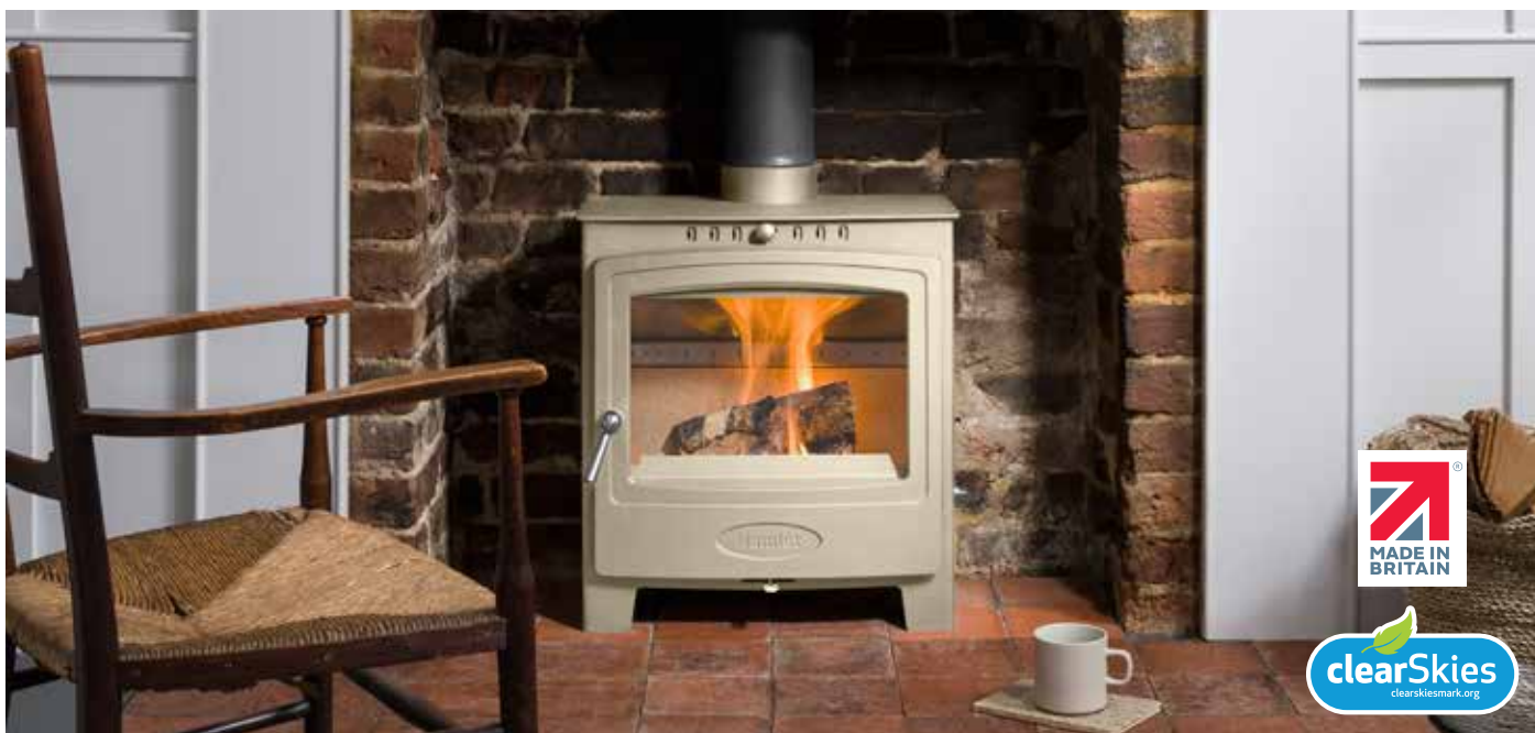
Solution 5 Widescreen S4 shown in Sandcastle colour option

Ecodesign Ready and with a classic look.