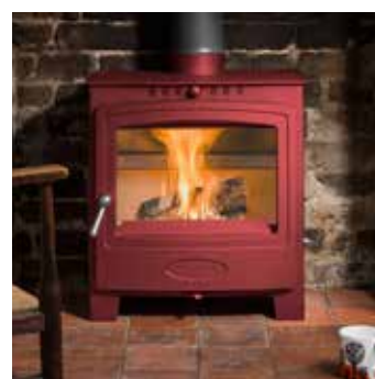
Eye-catching colour options

Optional Extras: Safety Handle / Rear heat shield / Floor fixing kit / Direct air connection