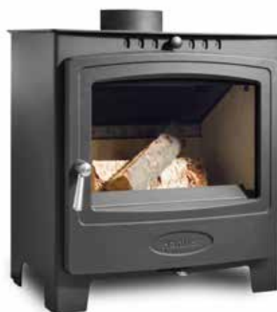
Solution 5 Widescreen