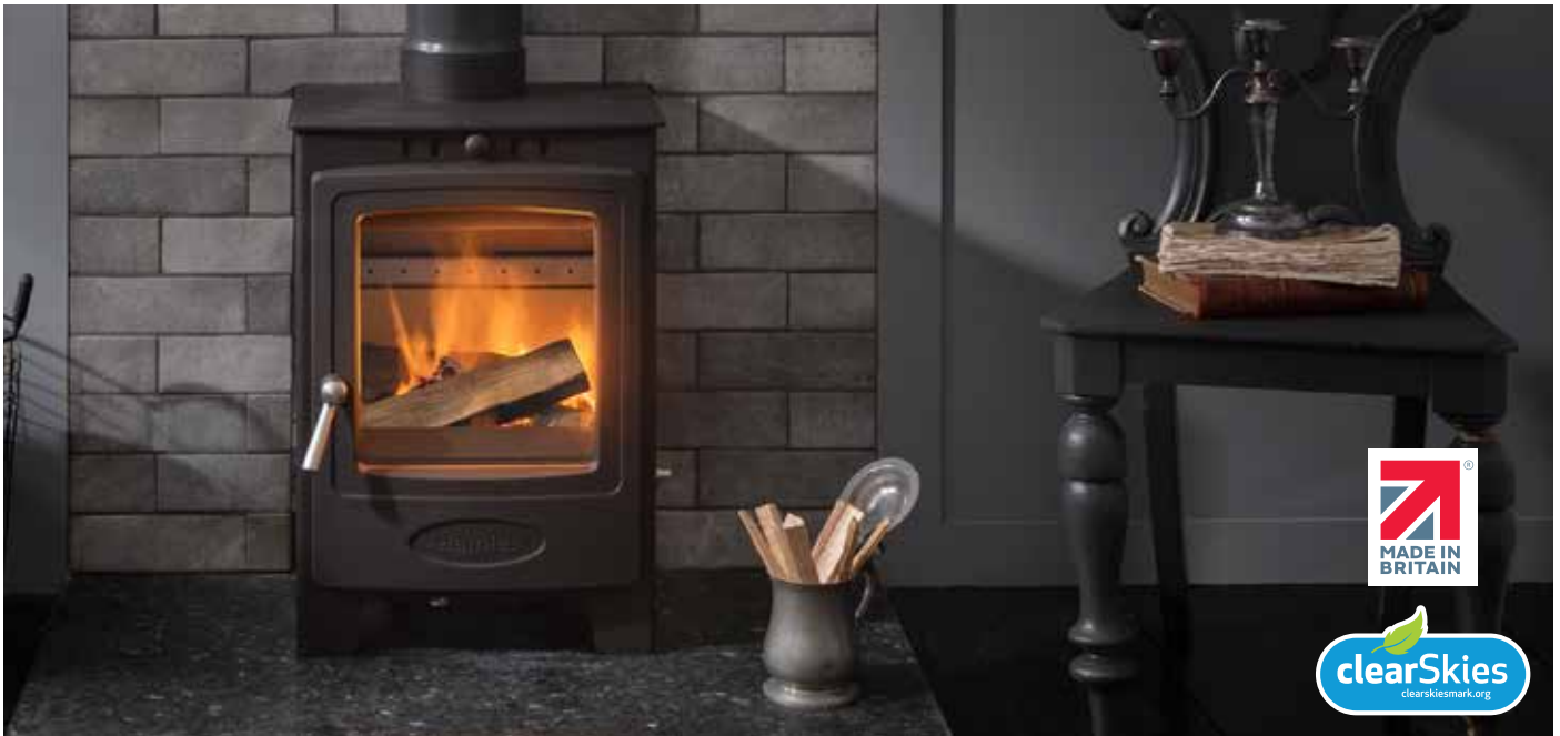
Solution 5 Compact Series 4

Ecodesign Ready and with a classic look.