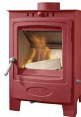
Alternative colour options available (Spice Red shown)