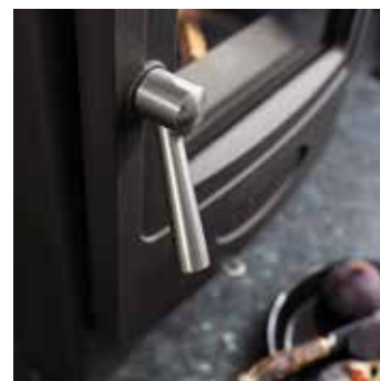
Stylish cast iron door

Optional Extras: Safety Handle / Rear heat shield / Floor fixing kit / Direct air connection