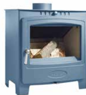
Colour options available (Atlantic blue shown)

Optional Extras: Safety Handle / Rear heat shield / Floor fixing kit / Direct air connection