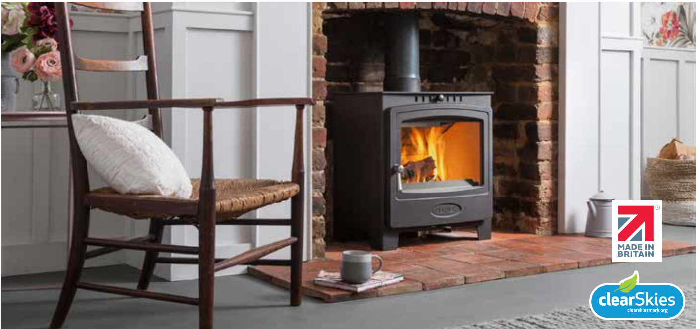
Solution 7 Series 4

Ecodesign Ready and with a classic look.